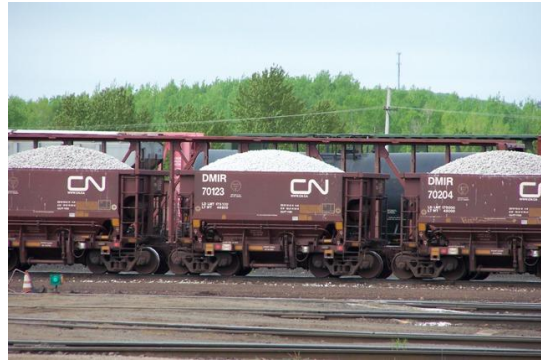
DM&IR new mini-quads