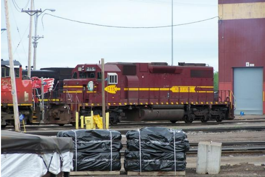
DM&IR 215 – one of the last