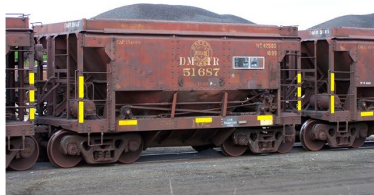
DM&IR original mini-quads