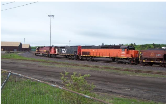
DM&IR 403 – Leaving Proctor yard