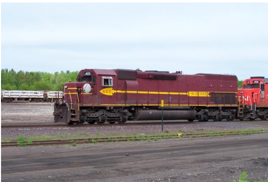
DM&IR 403 – the other original