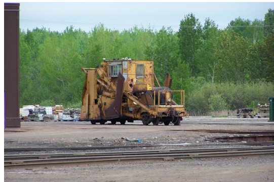
DM&IR Jordan Snowplow at Proctor roundhouse