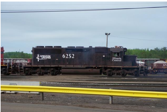
IC 6252 – Operation Lifesaver