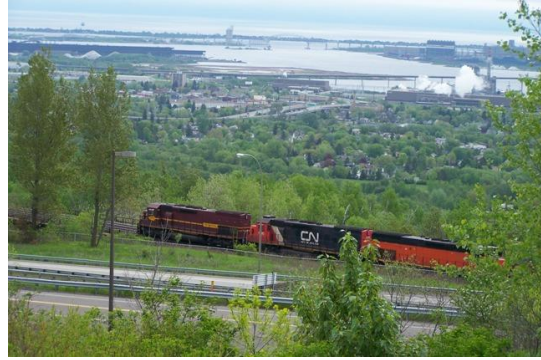
DM&IR 403 – Heading to Dock #6