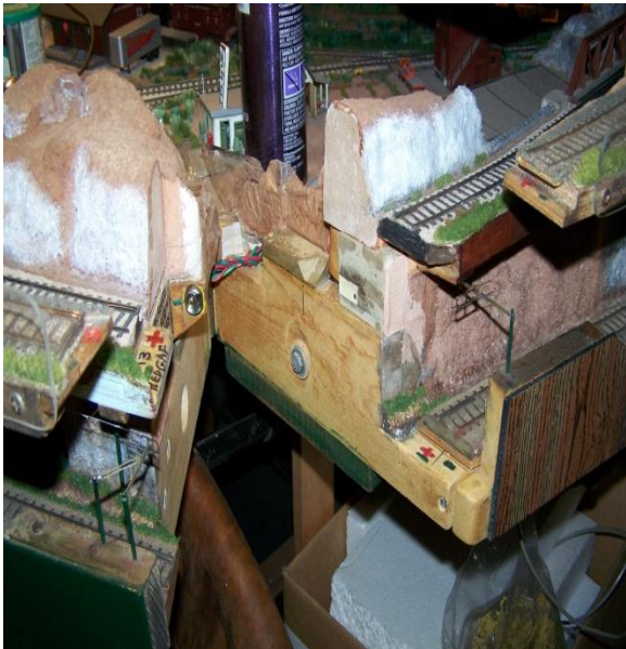
Bonus photo #22