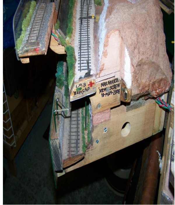
Photo #17: A companion end of the pull-out for section in photo #16. A bullet catch (Stanley CD5357 US3), brass and steel, carries the ground wire connection for the mainline (center track). It shuts off power when open and makes a noise when opening or closing.