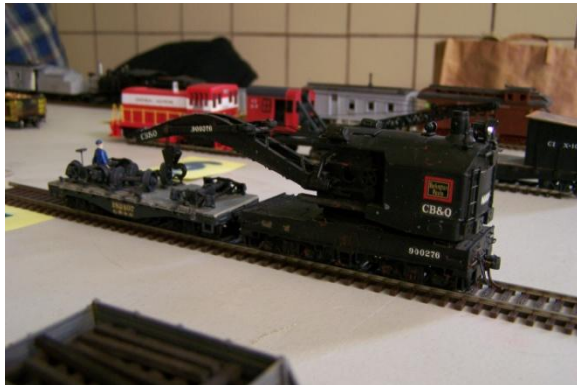
1 st Place – Joe Bennett