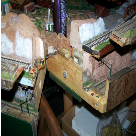
Photo #18: The pull-out “bridge” is open. Note places to hide track designations, crib notes and rail polarities. The dead-center bolt secures the large piece of wood to the section. This piece secures the hinge and is not used for alignment. The hinge pin never needs to be pulled.