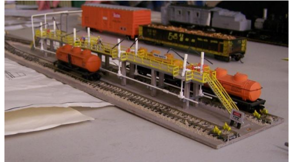
2 nd Place (tie) – Fred Henize