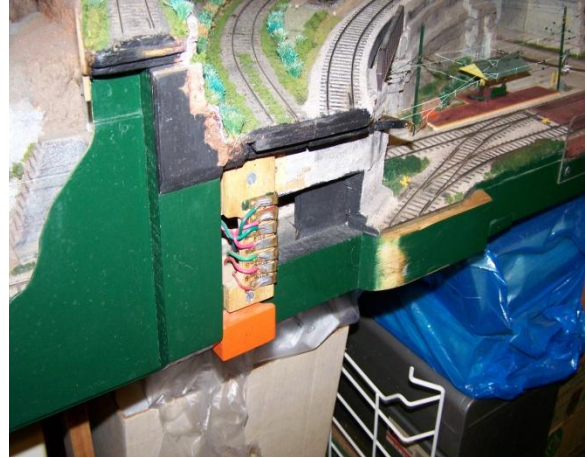
Bonus photo #23