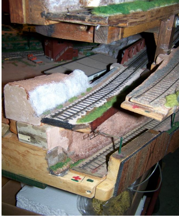
Photo #16: End of section with pull-out. Each track has only one guard (or guide) rail, placed to lure derailed equipment away from the layout edge, normally in the inside of a curve. The lower track has a lap joint. The upper tracks use the tongue and groove method, necessary if the track's end has strayed too far from a solid support from the lower levels and to help against warping.