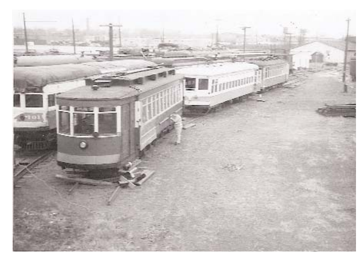
Getting the cars ready at North Chicago.

And so it went. Three additional hospital trains journeyed from North Chicago to Union that summer on May 31st, June 7th, and August 22nd. Eight pieces of