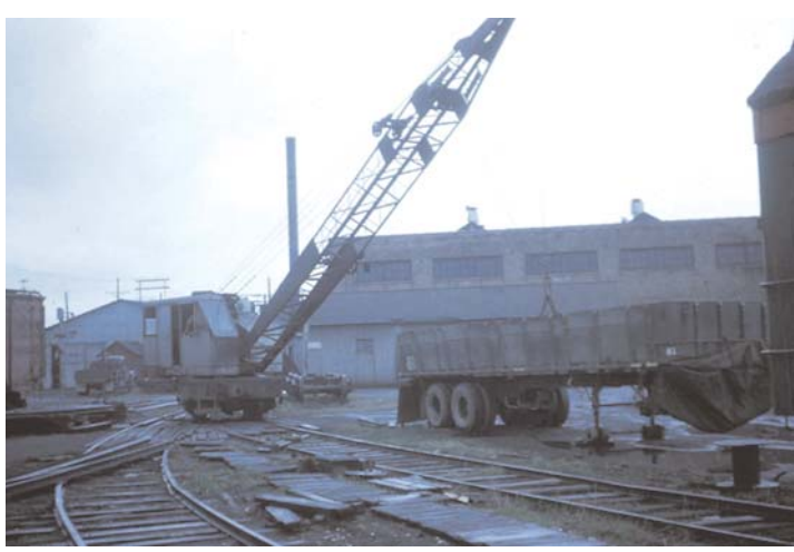
Pulling up rail prior to its delivery in Union.

John Horachek: "The guys went out (to Union) with chain saws and axes and hatchets and cleared the right-of-way, pushing debris to both sides of where the track would be. The CNW put in the switch (from their main line) and we started hauling rail and ties out there and made the connection track across the CNW property onto the (Museum) property".