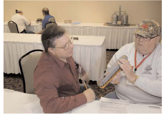
Two judges deliberating over one of the models prior to judging. A critical eye is required.