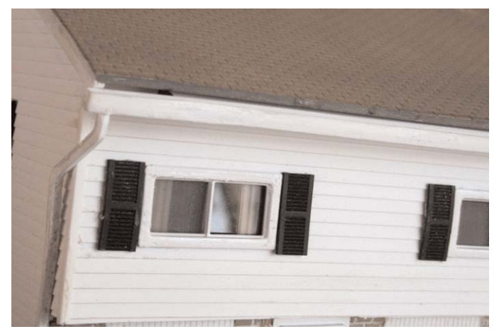
Completed screen installed in the windows. Realistic and easy to do.

Part 1: Screening for Doors and Windows This is the first article in a new series, The Frugal Modeler, aimed at helping conserve hobby dollars by using ordinary household items, often stuff we would otherwise toss in the trash or the recycling bin.