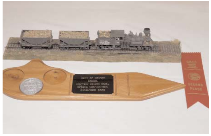
Best of Show-Novice Don Erlandson- two truck Shay and ore cars