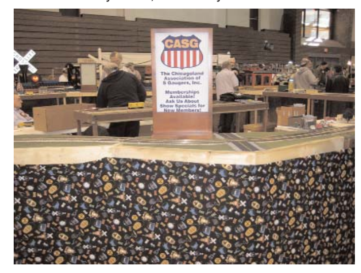
This skirting caught my eye. It would make great curtains in the layout room.

The following weekend was High Wheeler. We got lucky with the weather and the attendance was good. Between taking tickets at the door and manning the Soo Line Historical Society booth, I was busy.