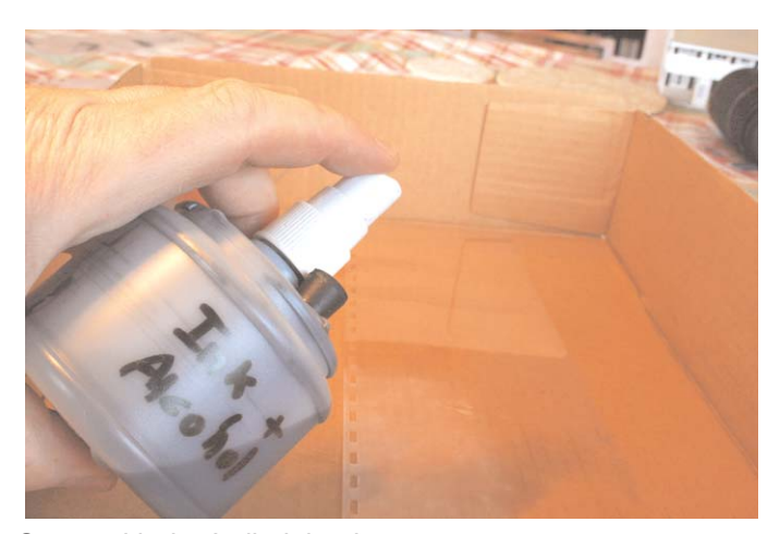
Spray with the India ink mixture.

After blowing or brushing aside loose fragments, the plastic will look frosted but not much like screening. That is where the India ink comes in. In a spray bottle, perhaps also reclaimed from the recycling bin, combine drops of India ink into pure drugstore alcohol. Keep adding drops of the ink until the shaken mixture is as dark as tea; the exact proportions seem not to matter in my experience (various strengths of this India ink/alcohol mix, by the way, are my universal weathering/darkening agent, used on ballast, track, scenery, and trees). Spray evenly. The plastic needs to be plastic perfectly flat so the ink does not puddle. A puddle can be addressed with a cotton swab so have those handy. You may need to blow lightly on the wet ink