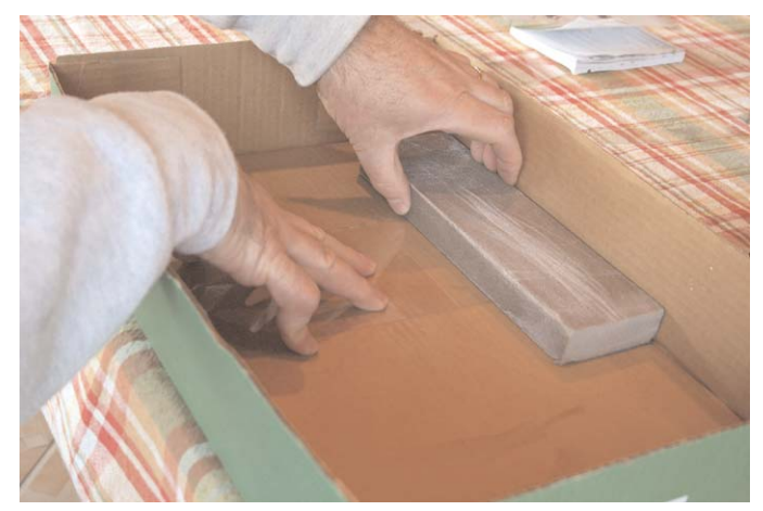
Run the abrasive pad along the sides of the box to ensure you scribe a 90 degree angle.

inside of a box lid works. Turn the piece if that's what it takes to make all motions exactly straight. Make no circular motions; do not vary from long, straight motions in precise 90 degree angles. Be thorough, light, and even in your sanding. The goal is to have a perfect cross hatching effect on the plastic that replicates the regular pattern of genuine screening without individual lines or gouges at odd angles showing.