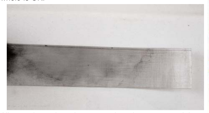
Allow to dry and you have a section of screen material to keep those pesky summer insects out.

mix to smooth it across the plastic. Thanks to the alcohol in the mix it dries quickly. The ink will occupy and darken each of the minute lines gouged in the plastic and the end effect replicates the darkened but still see-through appearance of genuine screening. If you had puddles you will note the darker spots they leave. If the rest of the material looks good to your eyes, either use only what looks uniform, or reapply the spray and try to even things out. Similarly if it looks too light and clear, re-spray your mix, and consider adding more ink to the mix. Remember that each individual door and window will be comparatively small so some variation in shade on the large piece as a whole is OK.