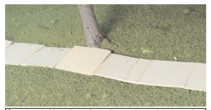
Completed sidewalk easily replicates the undulations of the ground and upheavel due to tree roots.

Now you have a ribbon of concrete sidewalk, road, driveway, or parking lot, ready for placement. A thin coat of liquid nails or adhesive caulk will hold the duct-taped sidewalk, street, or driveway in place. It can be as flat and even as any commercial product if the underlying surface is flat, but the real advantage to this method is that the tape-backed concrete segments adapt to uneven terrain in an interesting manner. For more extreme tilting to the side, such as at a tree root, cut partly into the tape between segments. A bit of adhesive and green ground foam in the gaps will model the weeds and grass that so many old sidewalks have.