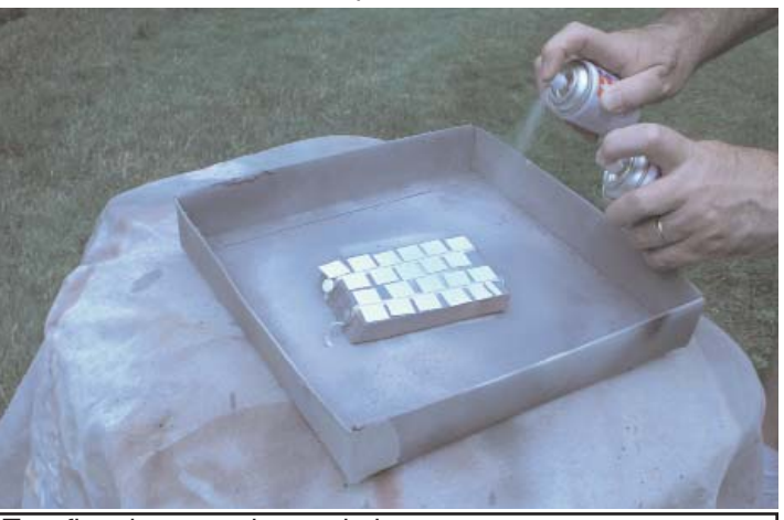
Two fisted approach to painting.

sticky surface will make it easier to handle. Place the plastic sections, painted side up, on the tape in a straight line, like a ribbon or string of dominos or Scrabble letters, with very slight gaps between them. A metal straight edge along one edge of the tape can keep the sections regularly spaced and parallel. You can get two lengths of sidewalk out of the standard width tape.