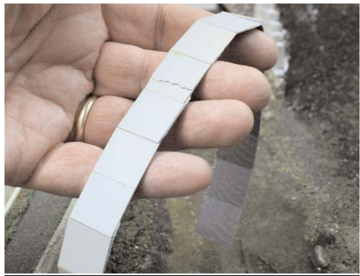
A completed section of sidewalk ready for installation.

some of the duct tape or threads at the ends and sides. Again, be careful not to cut into the plastic.