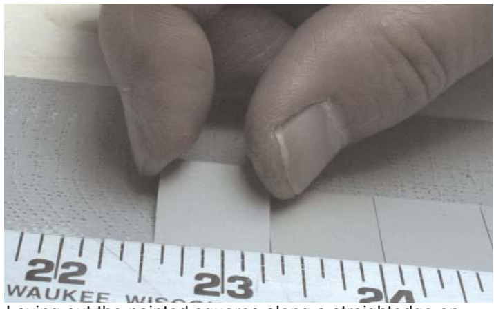
Laying out the painted squares along a straightedge on duct tape.

Once your length of street, sidewalk, or driveway looks acceptable, take a knife with a fresh blade and cut away the visible duct tape. Take care not to gouge or cut the plastic. Lift up your sidewalk or street, which will droop limply. It may be necessary to use a scissors to trim up