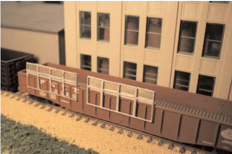
with Tamiya rattle can TS-17, Gloss Aluminum. Both of my models are shown on an HO scale mill gondola.

ing, were removed with a wire brush in a Dremel tool. Thus, any aluminum soda can would do. Everything except for the aluminum itself was painted