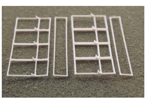
Waybill Spring 2014 page 5

There are vague indications in the photos that triangular shaped gusset/supports, perhaps 6 inches