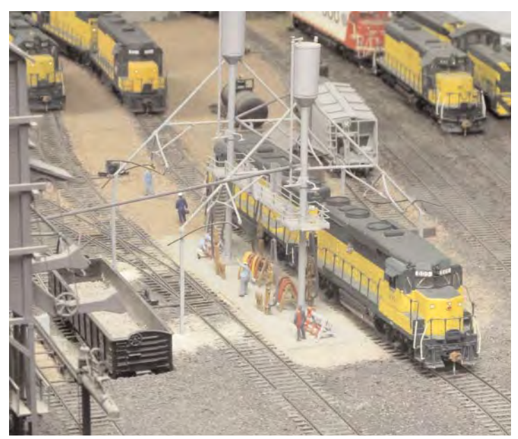
Dale Krueger's nicely done 17' x 23' Chicago and North Western layout was also on Sunday layout tours. The layout runs point to point with two large end yards sitting side by side. This busy diesel facility serves both yards and is located next to a roundhouse and the steam servicing facilities.