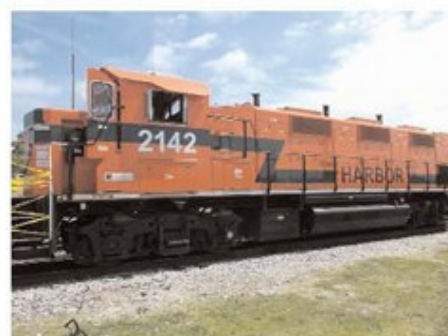
At Railroad Daze in June, a UP SD70AII and an IHB Genset switcher were two locos you could view and tour.