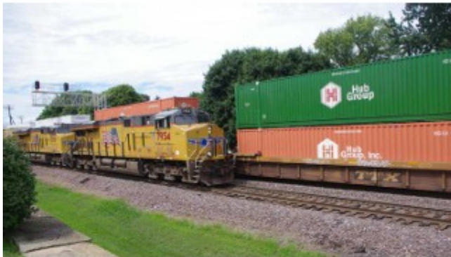
Action on both tracks is not uncommon as can be seen on this photo of a freight drag rolling by a container train.